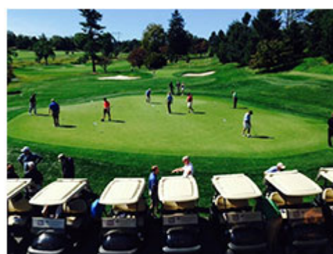
SOCMA members warm up before teeing off at the Annual Chemical Industry Golf Tournament in Malvern, PA. Register now for the 2015 event.

The tournament, which will take place at Chester Valley Golf Club located outside Philadelphia is set for September 29. Proceeds from the event will go to the American Chemical Society (ACS) Scholars Program , which raises scholarships for underrepresented minority students who want to enter the fields of chemistry or chemistry-related fields, such as environmental science, toxicology and chemical technology