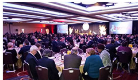
Mark your calendars now, and join us in New York City on December 7, 2015, for SOCMA's 94th Annual Dinner.

Mark your calendars now, and join SOCMA and hundreds of specialty chemical industry decision-makers on December 7, 2015, in New York City for SOCMA's 94th Annual Dinner at its new location – the Crowne Plaza Times Square Manhattan . Invite your VIP customers and colleagues to celebrate with you, and enjoy an evening of networking, fine dining and entertainment. Highlighting the event is SOCMA's donation to the American Chemical Society (ACS) Scholars Program and an awards ceremony honoring winners of SOCMA's Performance Improvement Awards .