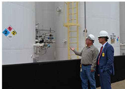
Congressman Brian Babin (R-TX) visited TM Deer Park Services Limited Partnership on August 20, where he toured the plant and talked with employees about issues impacting the chemical industry.